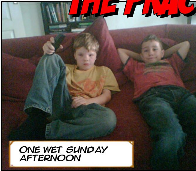
ONE WET SUNDAY AFTERNOON